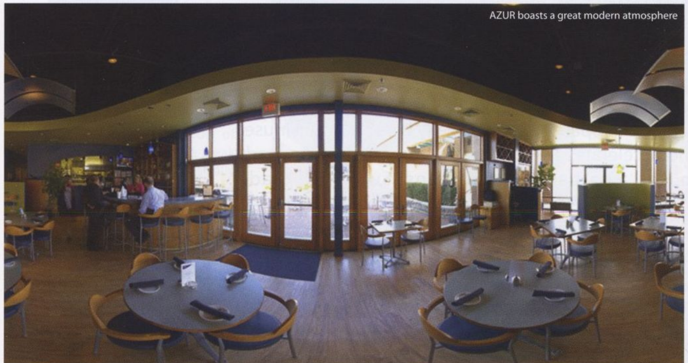
AZUR boasts a great modern atmosphere